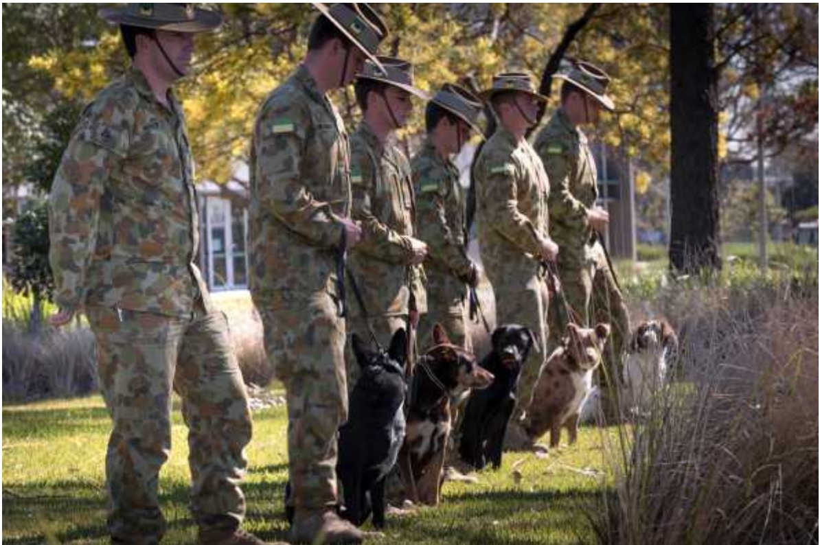
Sappers with Explosive Detection Dogs undergoing training at the ceremony. Luckily they weren't required.