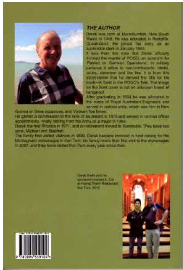
Front and back covers of Derek's book.

Much detail for this book has been drawn from diaries that Derek kept, particularly in 1966/67 and 1969/70. There are numerous other references noted in the footnotes. There is a list of abbreviations in the back of the book and it contains many photographs.