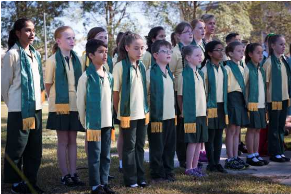
Wattle Grove School Choir